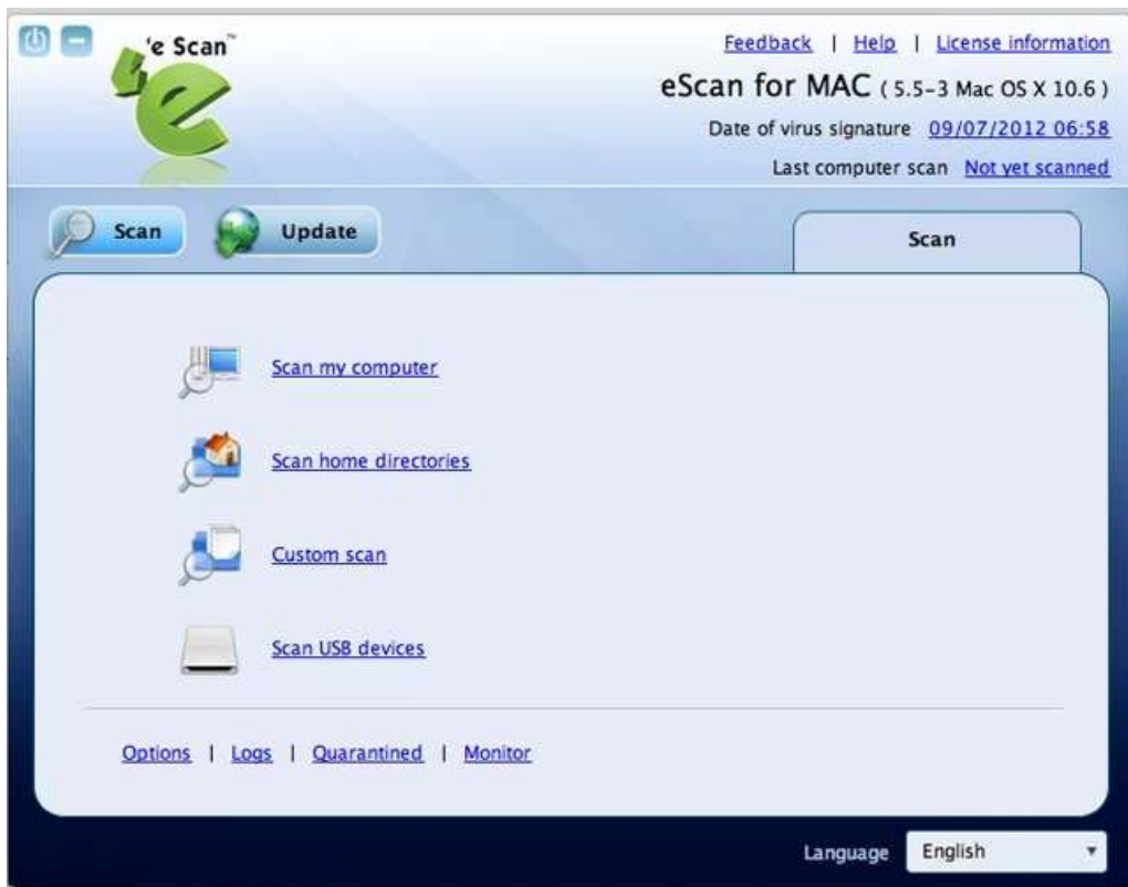
The main panel

include a full scan, scanning home directories, a custom scan, and a separate scan for USB devices. Logs and data monitoring is possible as well.