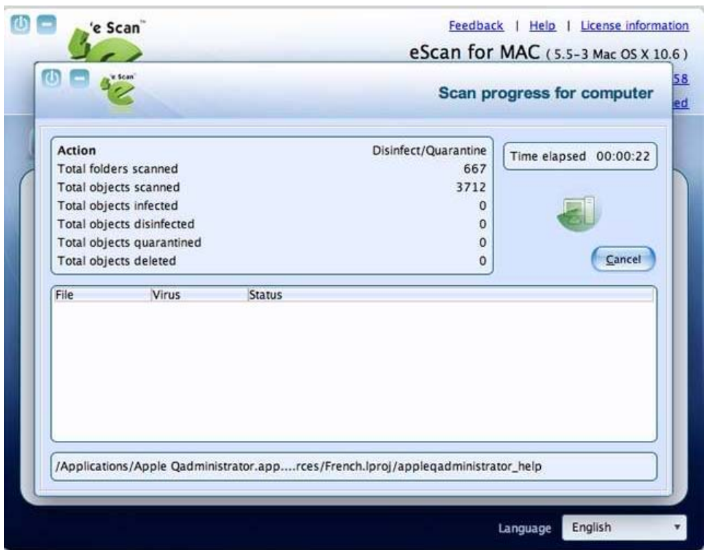
The scan screen

The current OS version supported is Mac OS X Snow Leopard 10.6 or later. System requirements include 1GB of available memory and 500MB of free hard drive space. Supported languages are English, Latin Spanish, German, Greek, Spanish, French, Italian, Dutch, and Russian. A 30-day trial version is available as well.