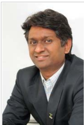
CEO & MD, eScan Antivirus and Content Security.